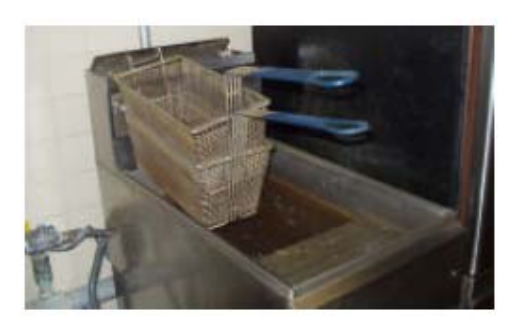
Recycle waste cooking oil