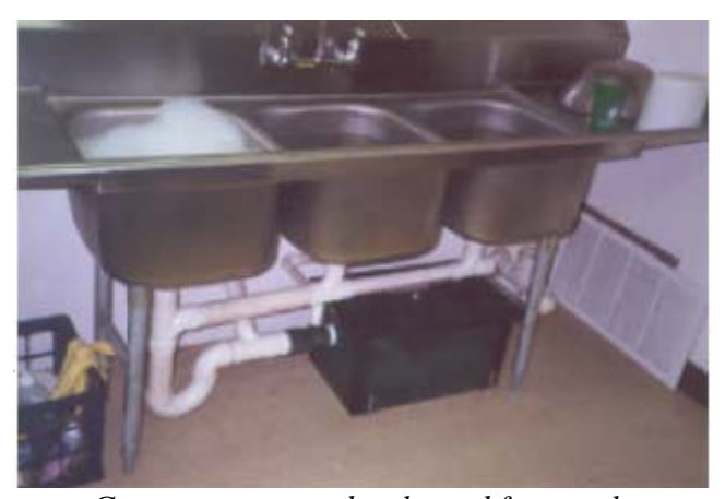
Grease traps must be cleaned frequently

Maintenance staff or other employees of the establishment usually perform grease trap maintenance. Facilities with grease traps must clean their traps weekly at a minimum. When performed properly and at the appropriate frequency, grease trap maintenance can greatly reduce the discharge of fats, oils and grease