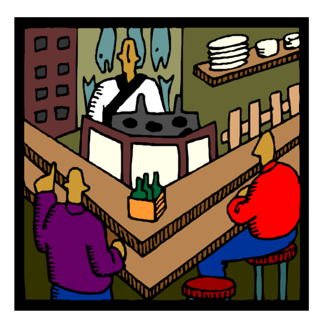
Fats, Oils, and Grease Best Management Practices Manual

Telephone: (707) 937-5790 Fax: (707) 937-3837