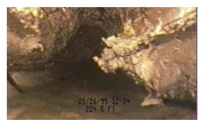
Grease clogged sewer